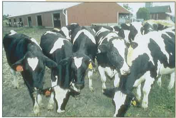
Approximately one-third of the total domestic non-fed beef production is derived from dairy cows.

Finally, Phase III included a strategy workshop convened to identify management practices which could be employed by cattle and dairy producers to correct the quality non-conformities identified during earlier phases of the study.