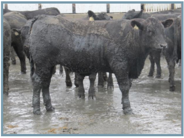
Mud and Manure Score 5