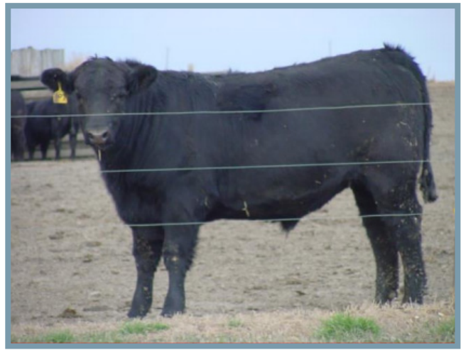
Mud and Manure Score 1