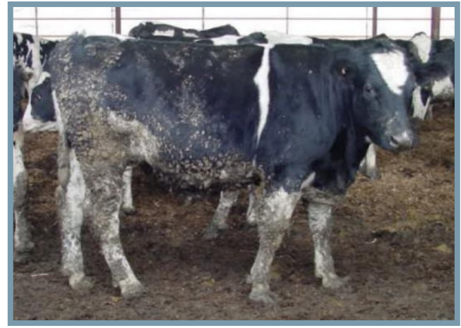
Mud and Manure Score 4