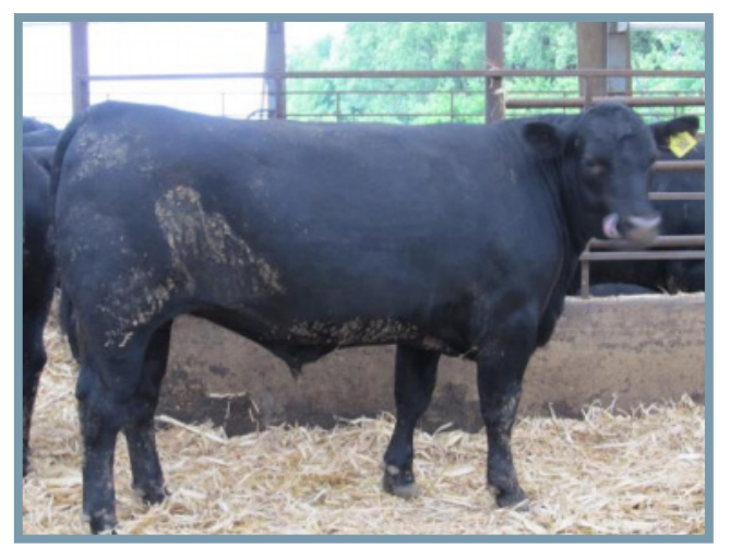
Mud and Manure Score 2