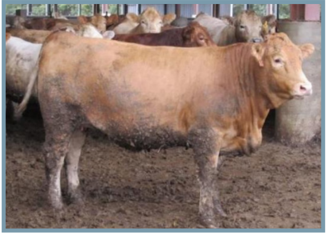
Mud and Manure Score 3